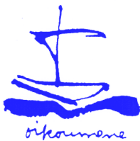
The Metropolitan Christian Council of Philadelphia